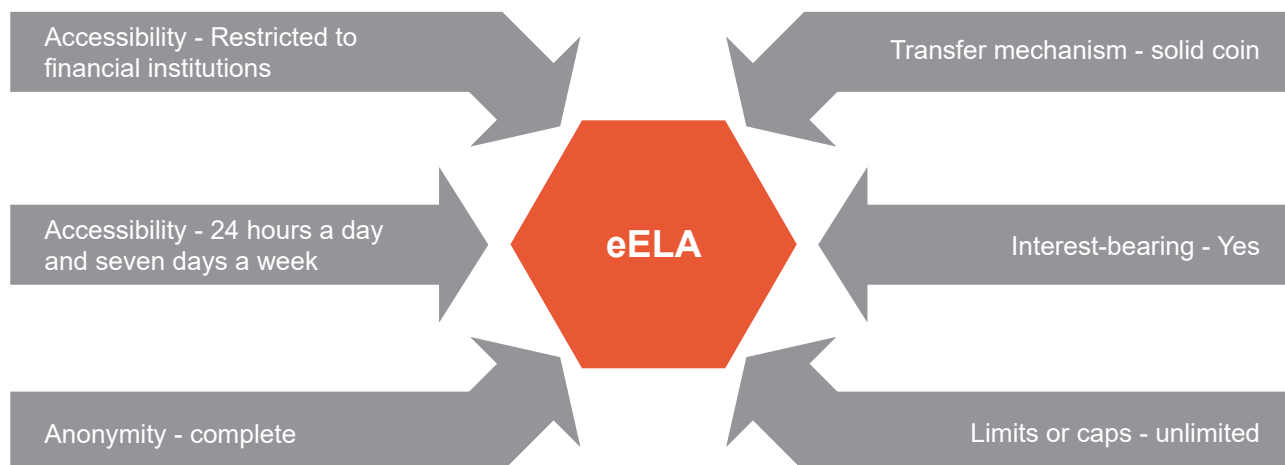
Figure 2: Design of eELA