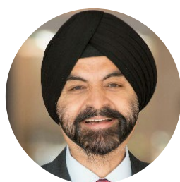
Ajay Banga Executive Chairman, Mastercard